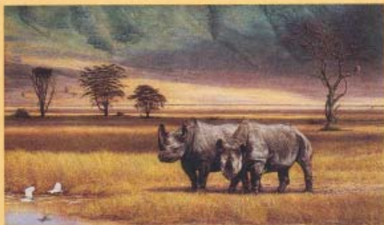
Companions of Ngorongoro